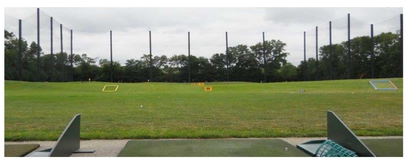
500 E. Van Buren