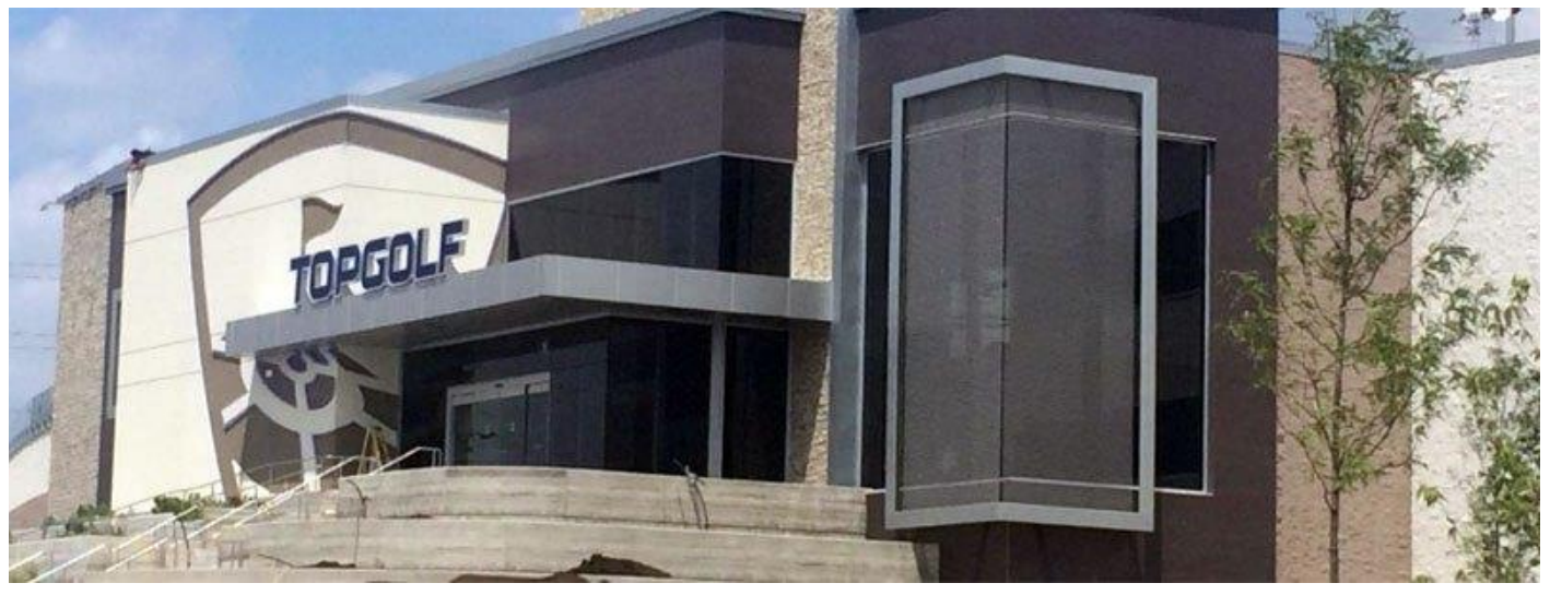
3211 Odyssey Court Naperville, IL

TopGolf offers a three-tiered, heated driving range. TopGolf tracks each ball hit and provides instant feedback on the distance and location of each shot. Their golf balls contain a microchip with your information imbedded into it. You'll fire shots out towards any one of the 11 recessed target greens, ranging from 25 to 250 yards or more in distance. You then receive immediate personalized feedback on the monitor screen that will visually show you exactly how far your ball was hit and how close it came to the flagstick.